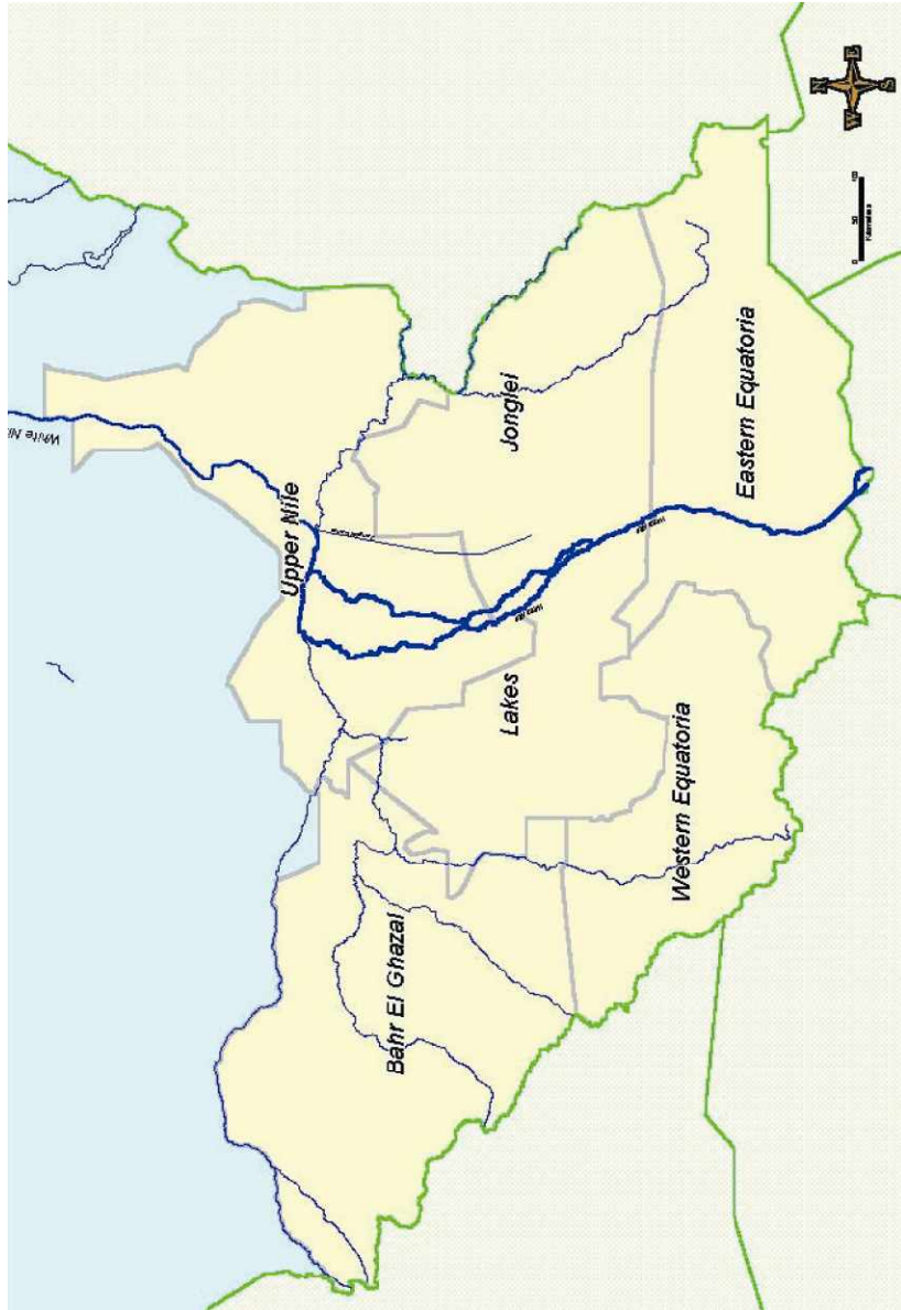
Map 1: Regions of the South Sudan